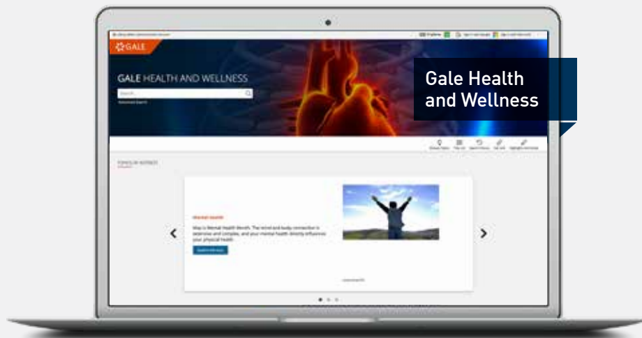
Product screen capture as of May 2024. Actual interface may vary.