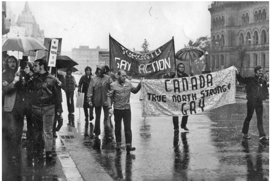
Between 100 and 200 people participated in the Toronto Gay Action protest on August 28, 1971. Jearld Moldenhauer, "Ottawa March Demonstrators," The ArQuives Digital Exhibitions.