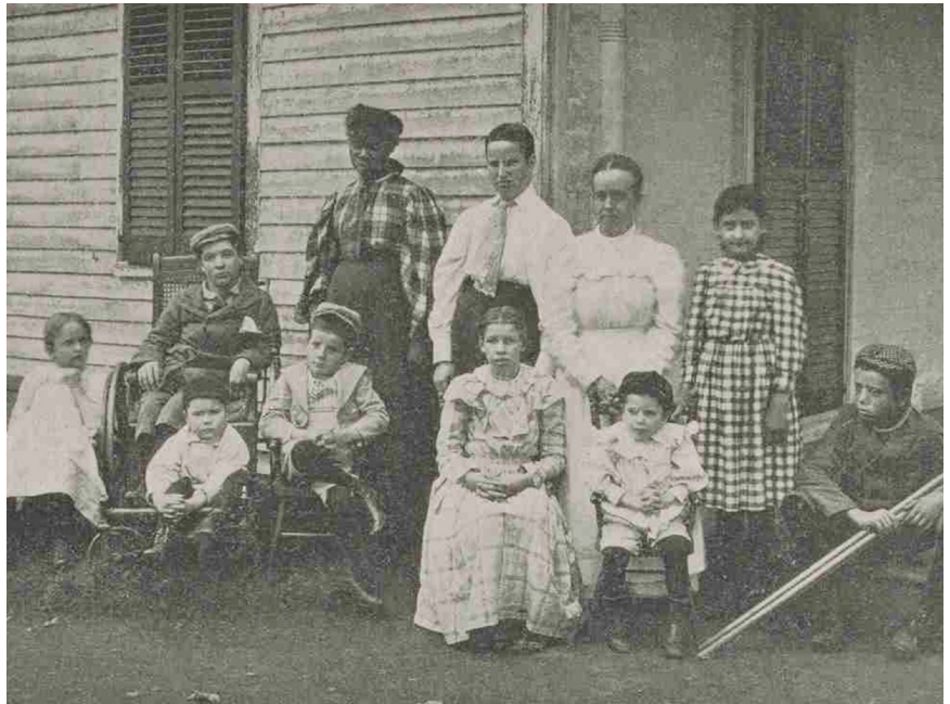
Children at the Newington Home for Incurables, Newington, Connecticut, circa 1899.