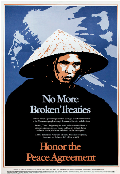
Antiwar poster from the Indochina Peace Campaign extolling readers to “honor the peace agreement,” referring to the Paris Peace Agreement that formally ended the Vietnam War, circa 1975.