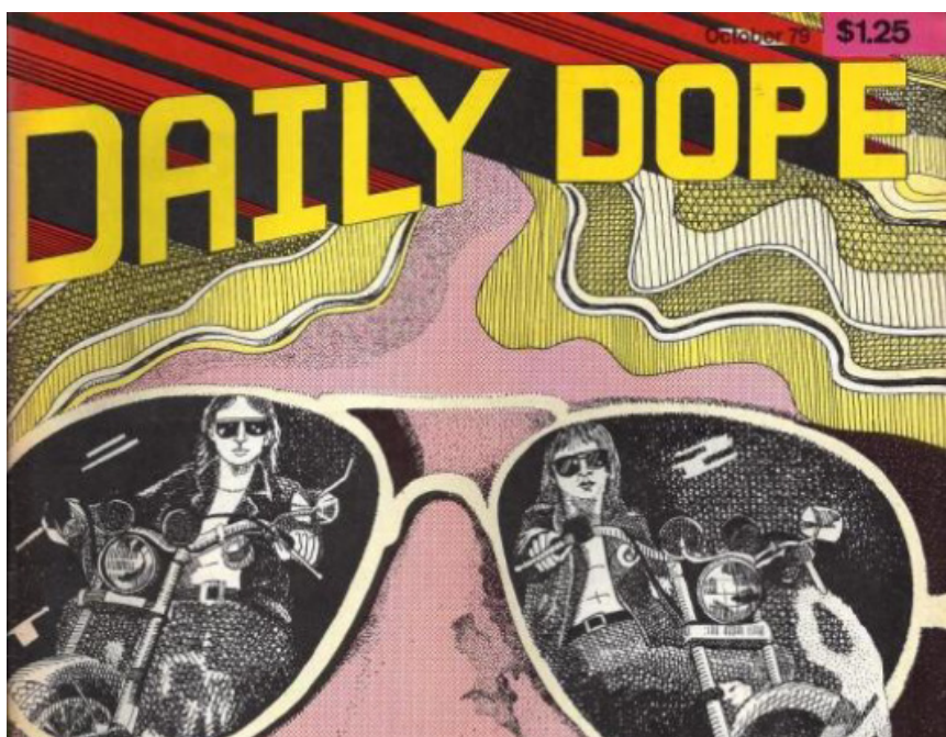
Cover section of Daily Dope #1, October 1979, Miami, Florida, from the Pacific Coast Counterculture Collection.