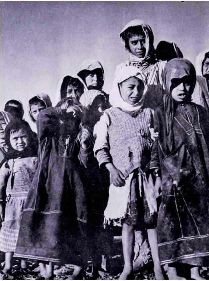
Image inset from a pamphlet containing a plea for help for Arab refugees, 1950; Crown Copyright images reproduced courtesy of The National Archives, UK.