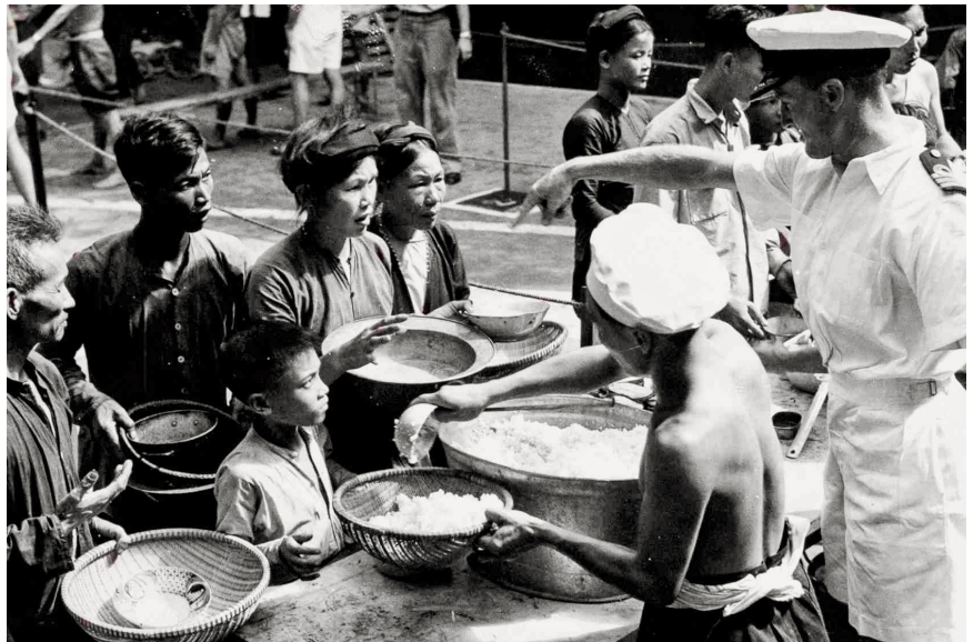
Vietnamese refugees aboard HMS Warrior after an evacuation by the Royal Navy, 1954